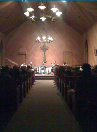
Concert in Old St. Hilary's