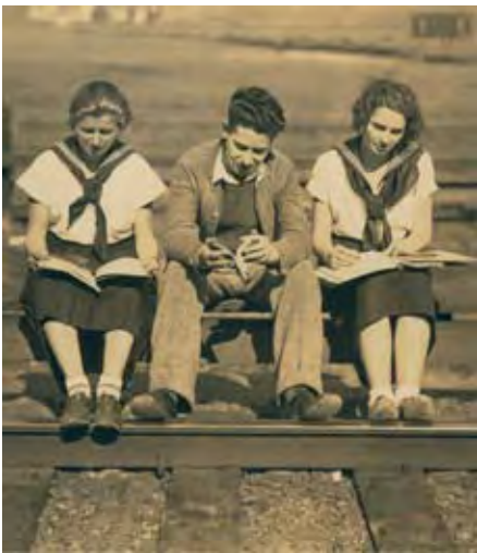
BELVEDERE-TIBURON LANDMARKS SOCIETY HISTORY COLLECTIONS

U.S. POSTAGE PAID PERMIT NO. 8 BELVEDERE-TIBURON CA 94920