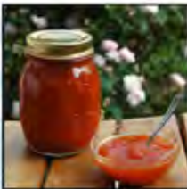
baked goods & preserves