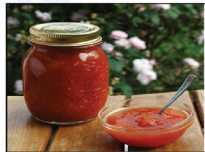
Baked Goods & Preserves