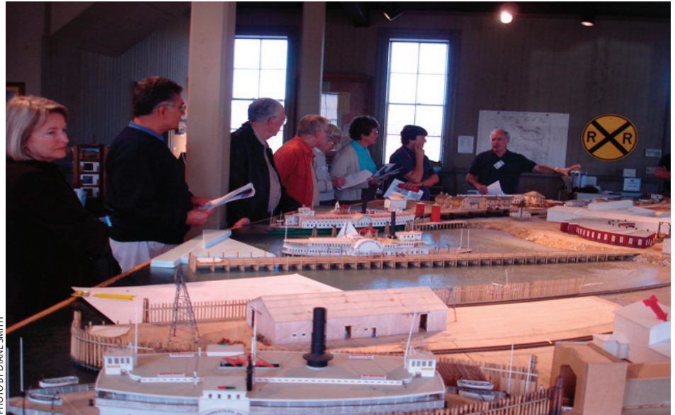
Visitors are always fascinated by the railroad-ferry model in the Depot Museum.