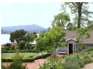
Art & Garden Center Open by appointment 841 Tiburon Blvd, Tiburon