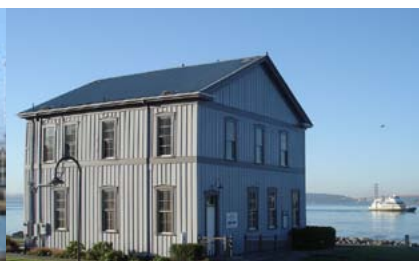
Railroad & Ferry Museum Open Wed thru Sun 1-4 p.m. 1920 Paradise Drive, Tiburon