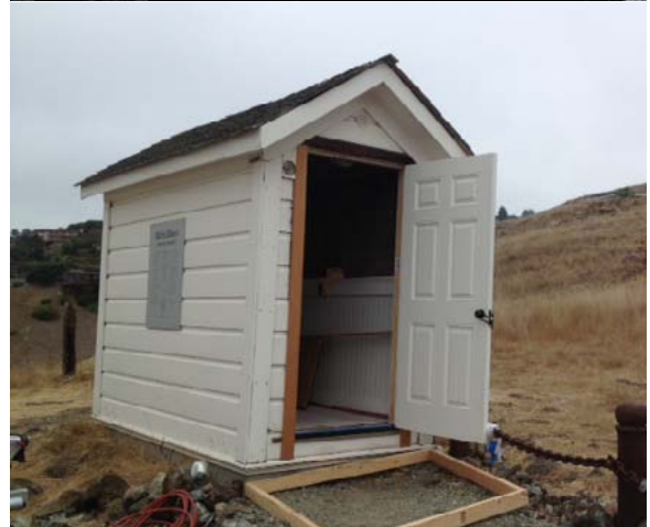
Above top: Old St. Hilary's “two-holer” outhouse circa 1940. Above: Outhouse under recent construction.

Early photographs and an oral history confirm that it was divided into two privies, male and female, with doors at opposite ends. Each side was a ‘two-holer’ sized to fit an adult and child. a precaution to keep a youngster from falling into the pit below.