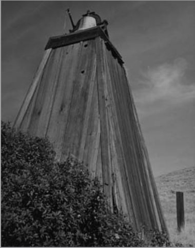
Bell Tower c. 1956