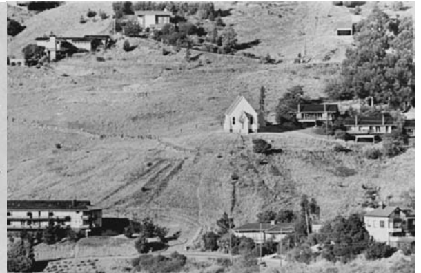
Bob Bastian sketch of proposed construction and Phil Molton photo of the landmark c. 1968