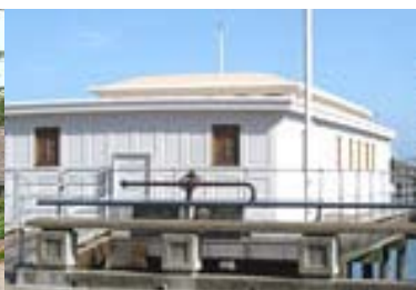
China Cabin Open Sat & Sun 1-4 p.m. 52 Beach Road, Belvedere