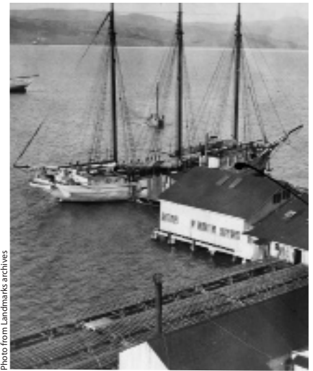
Cod Fishery on West Shore, 1912

Tiburon's popular summer street festival, Friday Night on Main, returns this summer, and Landmarks plans to be part of the action. Stop by to say hello and see what we have to offer, starting with a scavenger hunt on June 27. Look for our table on the following dates as well: June 27, July 11, August 15 and September 26.