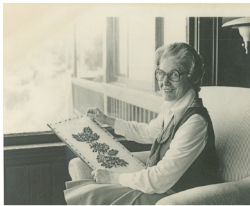
Needlepointing a cushion for Old St. Hilary’s pews, 1975

She was president of the Landmarks Society for its first 10 years and spearheaded the acquisition and restoration of the China Cabin, a National Maritime Monument; the Railroad & Ferry Depot Museum, which is on the National Register of Historic Places; and the Art & Garden Center, the Landmarks Society’s newest site. She remained on the Board of Directors until she passed away in April.