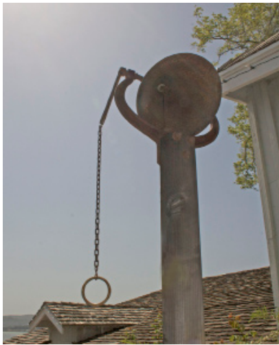
Old bell now at the Art & Garden Center

THE LANDMARKS SOCIETY 1550 Tiburon Boulevard Belvedere-Tiburon, CA 94920