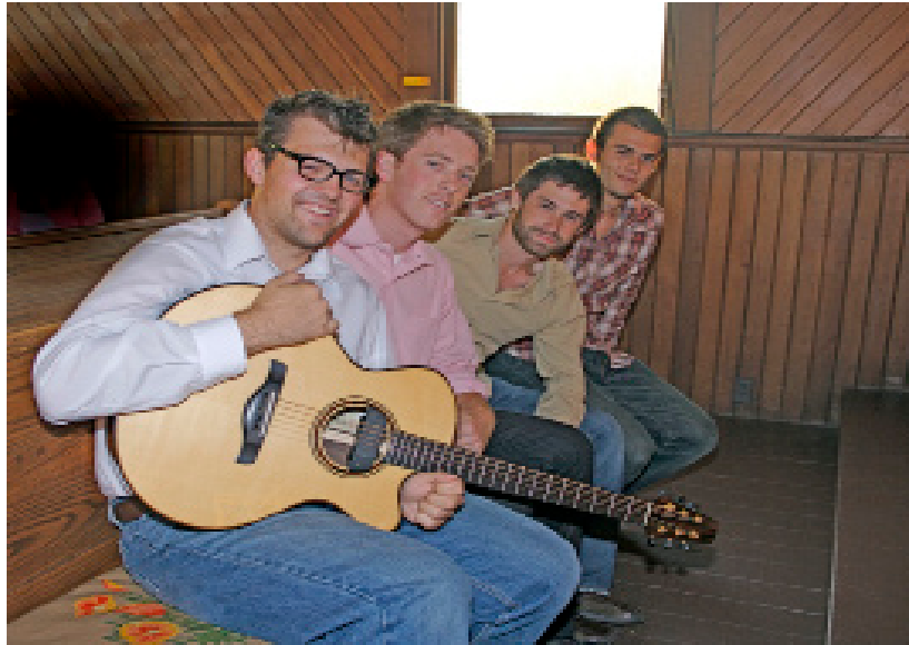
New West Guitar Quartet

If you're an aficionado of strings, Old St. Hilary's is the place for you the weekend of September 5 through 7, when the Landmarks Society and the Tiburon Heritage & Arts Commission host the Tiburon Guitar Festival, an event that's sure to be memorable.