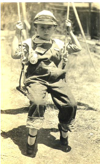
BELVEDERE-TIBURON LANDMARKS SOCIETY HISTORY COLLECTIONS

U.S. POSTAGE PAID PERMIT NO. 8 BELVEDERE-TIBURON CA 94920