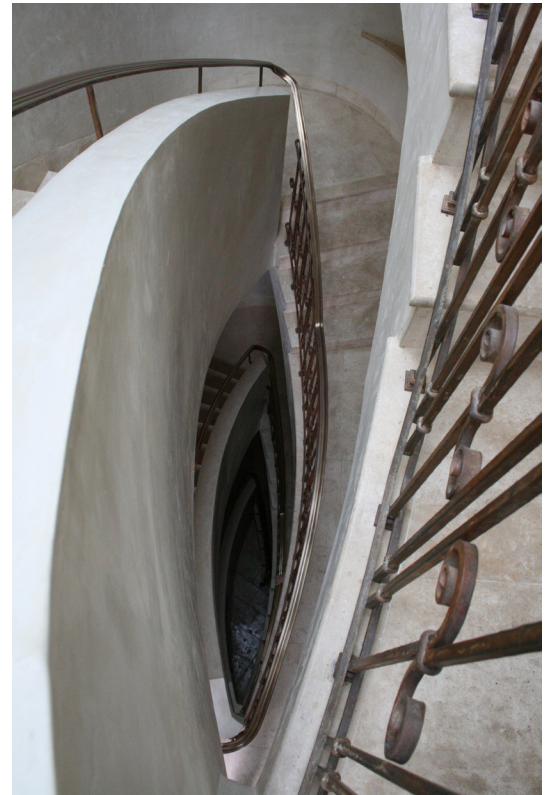
LOOKING DOWN BERNHEIM STAIRWAY.

May Day was a winner for the Landmarks Society and residents of Corinthian Island, several of whom graciously opened their homes to members of the society and their guests in celebration of the neighborhood's 100th anniversary. The Corinthian Island Centennial Tour drew 200 guests, who got an inside look at what a century's worth of diversity brings in 11 homes ranging from cottage to contemporary.