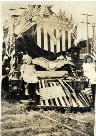
BELVEDERE-TIBURON LANDMARKS SOCIETY HISTORY COLLECTIONS

U.S. POSTAGE PAID PERMIT NO. 8 BELVEDERE-TIBURON CA 94920