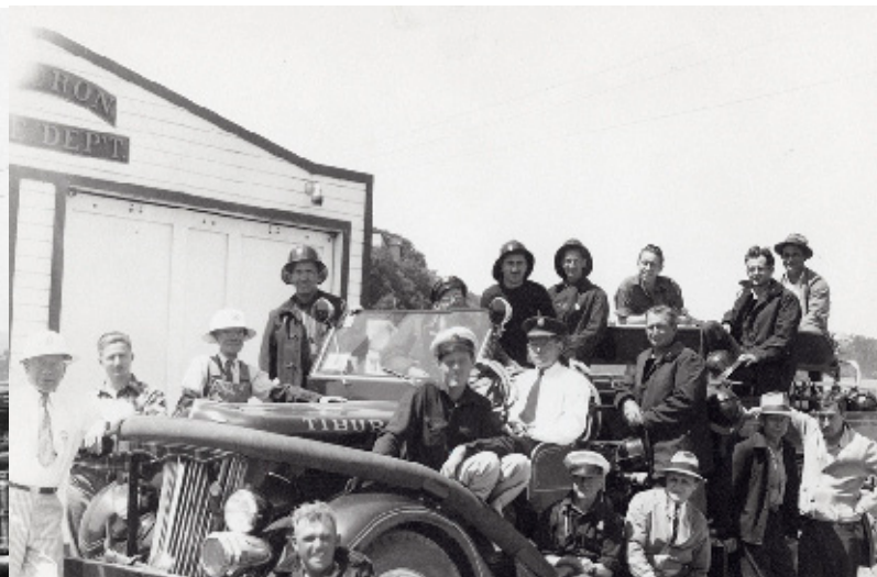
Tiburon Fire Department 1942