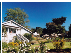
Art & Garden Center