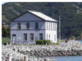
Railroad & Ferry Depot Museum