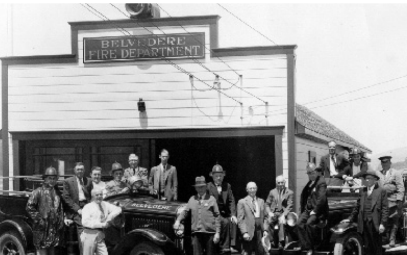
Belvedere Fires Department 1936

Bring a friend to see the newly revealed history! If you’d like to be a docent - and we could sure use your help - please contact the Landmarks office @ 435-1853 to learn more.