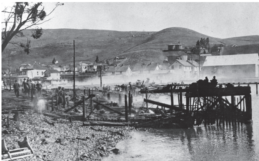
Main Street before the fire and after the fire in early 1920s. Look for the two railroad houses at the end of the street.