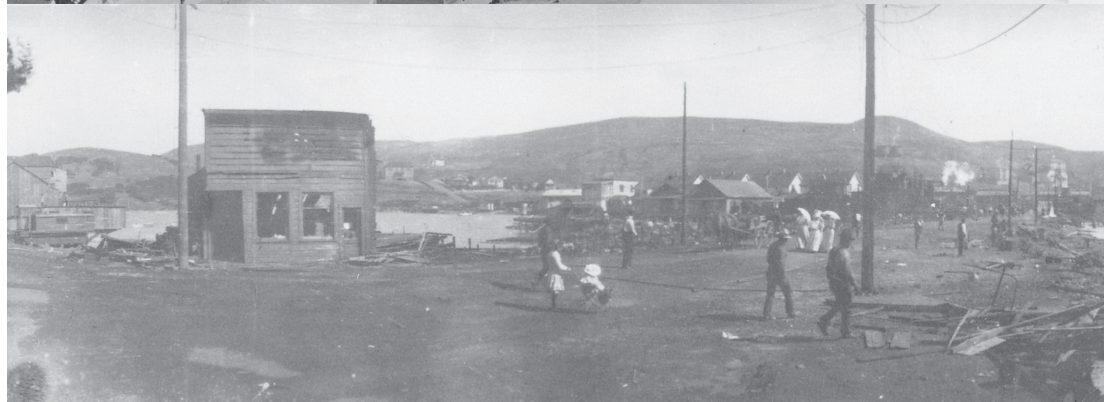
Main Street before and after the fire in early 1900s. Look for the tree on left and railroad housing at the end of the street.