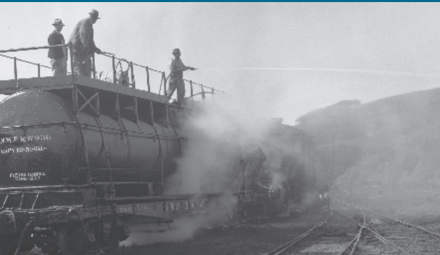
NWP Tank car converted to fire car c.####

A bi-annual publication of the Landmarks Society