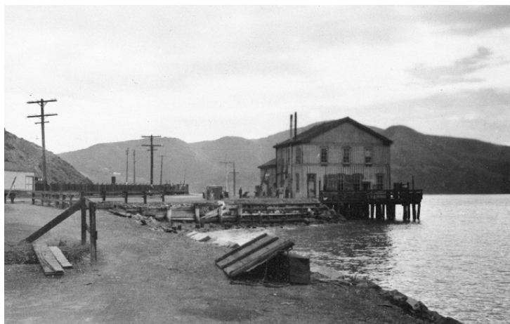
Photo from 1939 shows workers preparing the building for relocation. The eastern portion was removed at this time also.

These two photos show that the Railroad & Ferry Depot building (also known as the Donahue building) was moved from its original position partially over the water onto the shoreline. Notice the wooden beams reinforcing the shore in both photos showing how far onshore the building was moved.