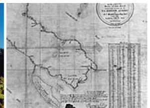
Railroad & Ferry Depot Museum