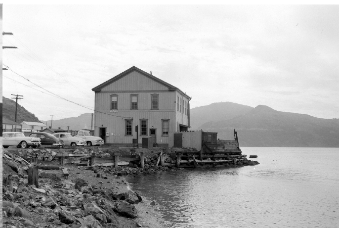
Photo from about 1957 shows the building moved onto shore, as it is today.