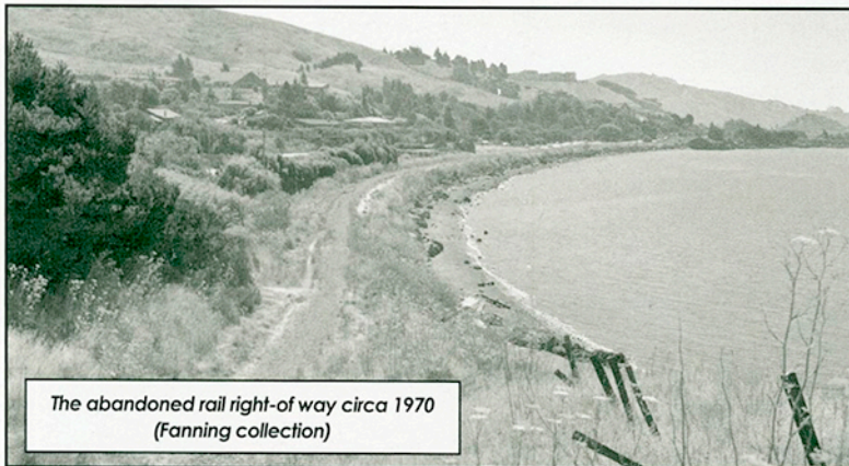
The abandoned rail right-of way circa 1970