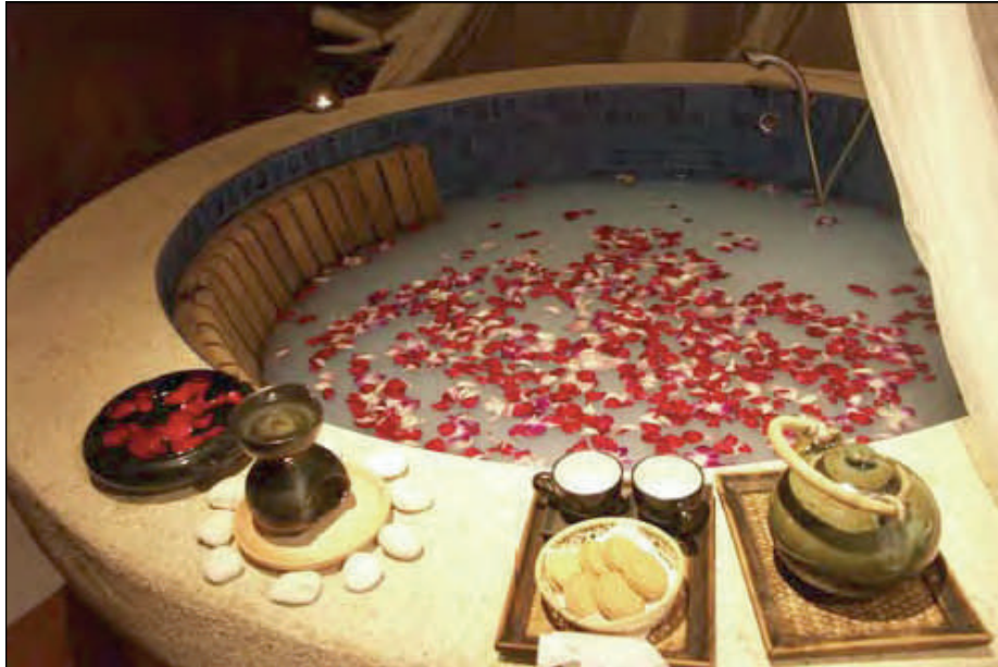
A hot herbal bath combines herbal inhalation therapy, medicinal teas, and a soothing environment. This treatment—or an herbal sauna—usually follows a Thai massage to provide treatment for all three essences.

Unlike in the Asian traditions, however, in the West, even when we find the three branches of medicine, these are normally quite antagonistic towards each other. It is true that you can find hospitals which include both a chapel and psychological services under the same roof and a more accepting approach to alternative techniques like acupuncture, but these practices have yet to be fully integrated. We are still a long way from MDs prescribing a visit to the herbalist or the priest!