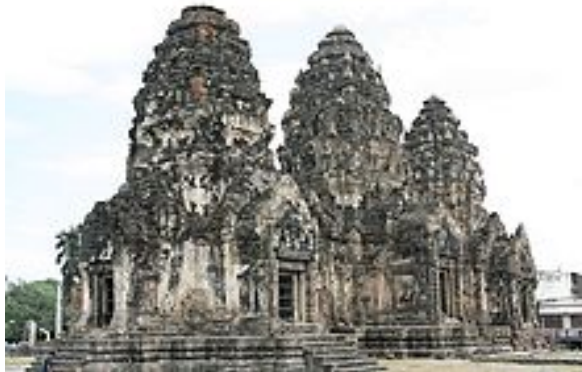
The Khmer temple of Wat Phra Prang Sam Yod in Lopburi

Around the 10th century, the city-states of Dvaravati merged into two mandalas – the Lavo (modern Lopburi) and the Supannabhum (modern Suphanburi). According to a legend in the Northern Chronicles, in 903, a king of Tambralinga invaded and took Lavo and installed a Malay prince to the Lavo throne. The Malay prince was married to a Khmer princess who had fled an Angkorian dynastic bloodbath. The son of the couple contested for the Khmer throne and became Suryavarman I, thus bringing Lavo under Khmer domination through personal union. Suryavarman I also expanded into the Khorat Plateau (later styled Isan), constructing many temples.