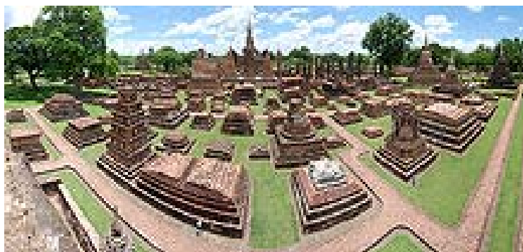
The ruins of Wat Mahathat, Sukhothai Historical Park