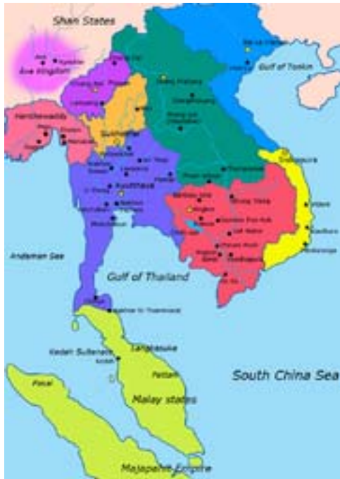
Southeast Asia c.1400 CE, showing Khmer Empire in red, Ayutthaya Kingdom in violet, Lan Xang kingdom in teal, Sukhothai Kingdom in orange, Champa in yellow, Kingdom of Lanna in purple, Dai Viet in blue.