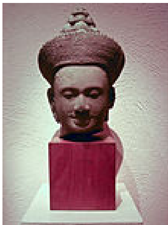
Khmer period sculpture of Vishnu, ~10th century

The Chao Phraya valley in what is now Central Thailand had once been the home of Mon Dvaravati culture, which prevailed from the 7th century to the 10th century. [5] The existence of the civilizations had long been forgotten by the Thai when Samuel Beal discovered the polity among the Chinese writings on Southeast Asia as “Tou-lo-po-ti”. During the early 20th century the archeologists led by George Coedès made grand excavations on what is now Nakorn Pathom and found it to be a center of Dvaravati culture. The constructed name Dvaravati was confirmed by a Sanskrit plate inscription containing the name “Dvaravati”.