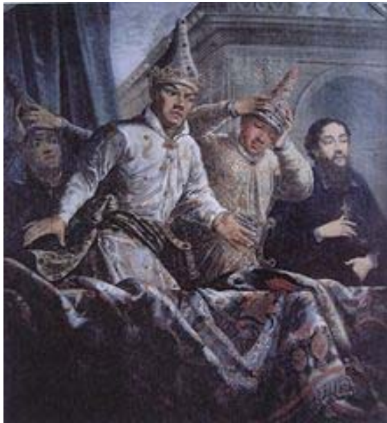
Kosa Pan to Louis XIV in 1686, by Jacques Vigouroux Duplessis