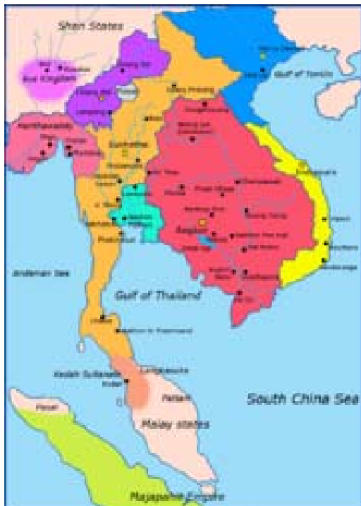
Southeast Asia c.1300 CE, showing Khmer Empire in red, Lavo kingdom in light blue, Sukhothai empire in orange, Champa in yellow, Dai Viet in blue and Kingdom of Lanna in purple.