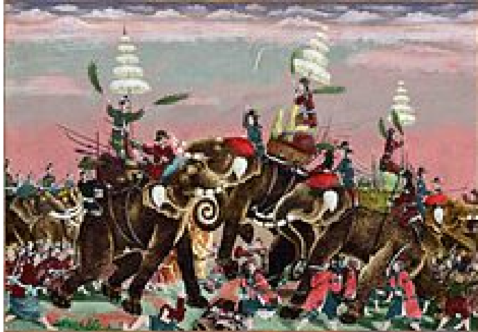
Siamese King Naresuan fighting the Burmese crown prince Mingyi Swa at the battle of Yuthahatthi in January 1593.