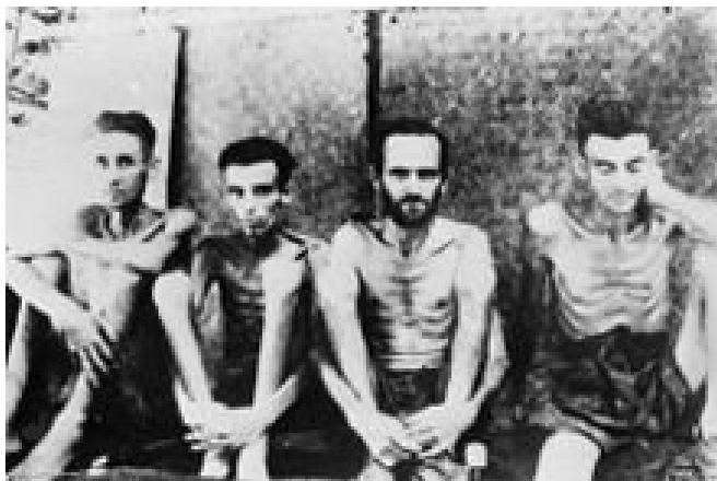
Australian and Dutch prisoners of war at Tarsau in Thailand, 1943

In early January 1941, Thailand invaded French Indochina, beginning the French-Thai War. The Thais, well equipped and slightly outnumbering the French forces, easily reclaimed Laos. The French, outnumbering the Thai navy force, decisively won the naval Battle of Koh Chang.