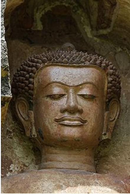
A Buddha from Wat Kukkut, Lamphun