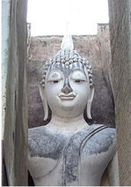
Phra Achana, Wat Si Chum, Sukhothai Historical Park

Thai city-states gradually became independent from the weakened Khmer Empire. It is said that Sukhothai was established as a sovereign, strong kingdom by Pho Khun Si Indrathit in 1238 AD. A political feature which "classic" Thai historians call "father governs children" existed at this time. Everybody could bring their problems to the king directly, as there was a bell in front of the palace for this purpose. The city briefly dominated the area under King Ramkhamhaeng, who established the Thai alphabet, but after his death in 1365, Sukhothai fell into decline and became subject to another emerging Thai state: the Ayutthaya Kingdom in the lower Chao Phraya area.