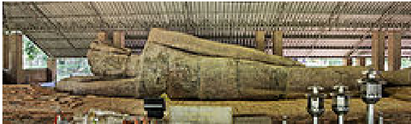
A 13 meter long reclining Buddha, Nakhon Ratchasima

The Chao Phraya valley in what is now Central Thailand had once been the home of Mon Dvaravati culture, which prevailed from the 7th century to the 10th century. [5] The existence of the civilizations had long been forgotten by the Thai when Samuel Beal discovered the polity among the Chinese writings on Southeast Asia as “Tou-lo-po-ti”. During the early 20th century the archeologists led by George Coedès made grand excavations on what is now Nakorn Pathom and found it to be a center of Dvaravati culture. The constructed name Dvaravati was confirmed by a Sanskrit plate inscription containing the name “Dvaravati”.