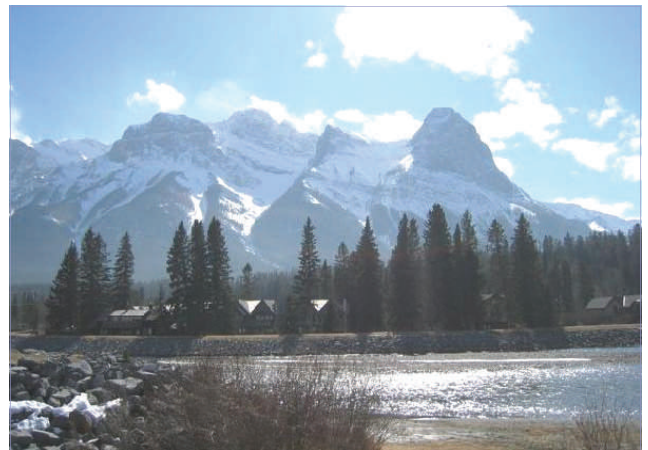
Above: Panorama of the Canadian Rocky Mountains, near Canmore, Alberta.