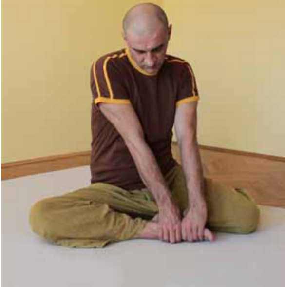
Working on the Sen on the foot Reusi Dat Ton