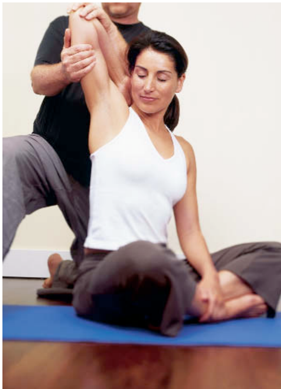
Opposite Page: Thai massage developed within a cultural context that emphasized the importance of meditation and mindfulness. Both practitioner and recipient seek deep mental quiet during the session.

from India to what is now modern Thailand, in approximately the second century B.C. For centuries, the traditional medical knowledge was transmitted orally from teacher to student. Over the centuries, a distinct tradition evolved that was primarily influenced by the Ayurvedic traditions from India, but also began to incorporate theories and practices from ancient China. In addition, healing practices of the indigenous tribal peoples of the area also became part of the local medical practices. By the time Theravada Buddhism was declared the official religion of the kingdom in approximately 1292 A.D., the traditional medicine was well established in the Buddhist monasteries, known as Wats. Traditionally, the Buddhist monks—and to a lesser extent Buddhist nuns—administered the healing work to the people in their villages.