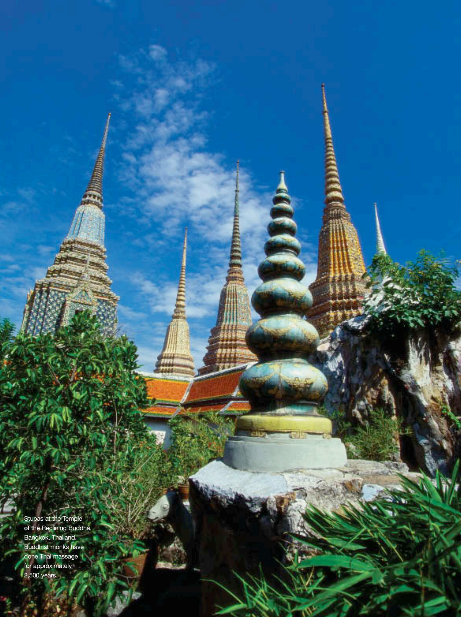
Stupas at the Temple of the Reclining Buddha, Bangkok, Thailand. Buddhist monks have done Thai massage for approximately 2,500 years.